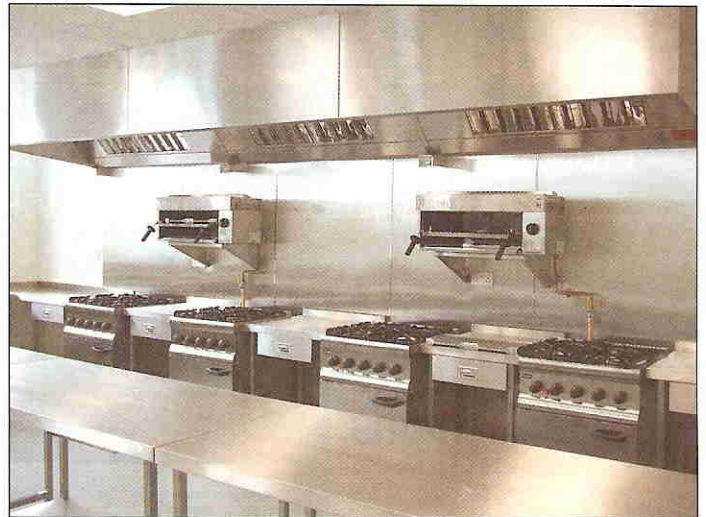
A close up of the kitchen.