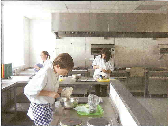
Pupils in the new catering training facility.